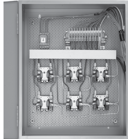
Example of Integrated Panel; wiring devices not included.