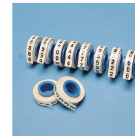
PMDR - * - *