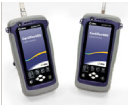
Two complete units minimize time initiating, naming, and saving results

*Please specify regional cables: North America (NA) Type A, European (EU) Type C, United Kingdom (UK) Type G, Australian (AU) Type I.