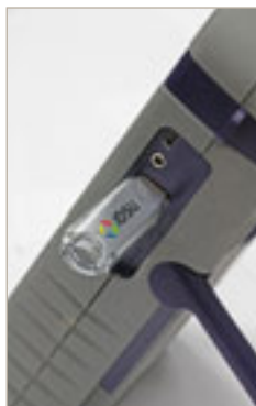
USB flash drive supports transferring test results