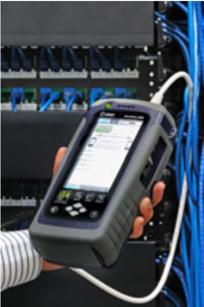
Easy-to-use large, graphical touch screen