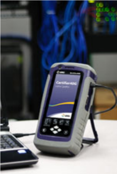
Complete PC desk-reporting software