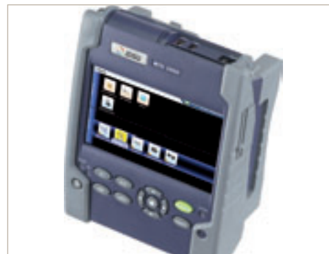
For more fiber testing and certification capabilities, combine the Certifier40G with one of the market-leading JDSU fiber testers, such as the T-BERD®/MTS-2000.

Visit www.jdsu.com/go/Certifier40G for more information, vendor endorsements, and product videos.