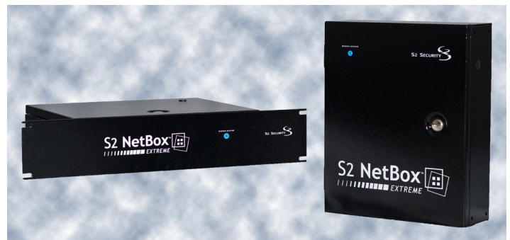
S2 NetBox Extreme is offered in wall mount or 2U rack mount enclosures.

Two storage options are available for the S2 NetBox Extreme : the standard 8GB SSD is ideal for most applications where historical data is periodically archived. In cases where it is desirable to keep a deep archive of historical data on the system, the optional 64 GB SSD can be ordered. Two mounting solutions are available: the standard wall mount and the 2U rack mount.