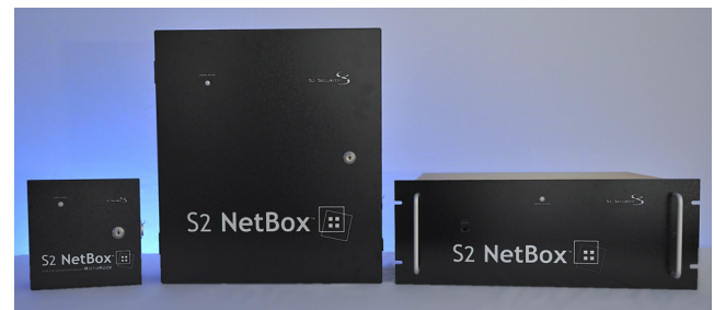
Several enclosure options are available for S2 NetBox systems.

Software for the entire system is embedded in the network controller. Updates are delivered online and completed in a single operation. Data storage is provided in flash ROM, removable compact flash, disk,