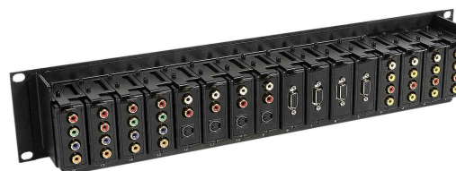
Fully loaded - rear view