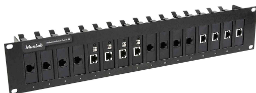
Fully loaded - front view