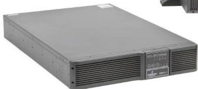
PSI XR 2U Rack version