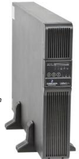
PSI XR 2U Tower version