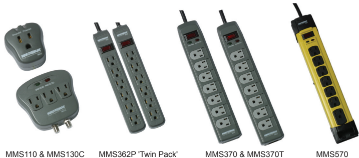
MMS110 & MMS130C MMS362P 'Twin Pack' MMS370 & MMS370T MMS570