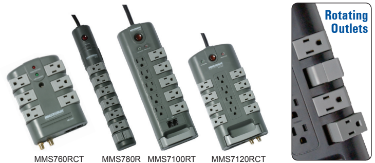
MMS760RCT MMS780R MMS7100RT MMS7120RCT