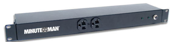
Surge Suppressor Power Distribution Units - MMS Series (MMS1020HV, 20-Amp, horizontal/vertical unit shown)

By adhering to the same philosophies and quality standards used in the design of uninterruptible power supplies, Simplicity, quality and value have been brought to products that supply rack and cabinet power to today's sophisticated network installations.