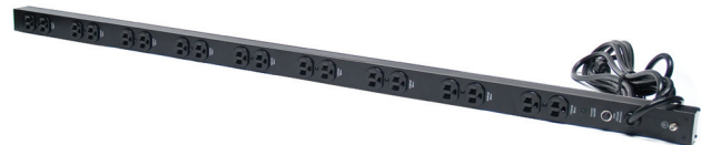
0U vertical mounting MMPD models (MMPD1815V48, 15-Amp, 48-inch vertical unit shown)