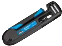
OmniSEAL Pro XL 30-793 – compresses BNC, F, and RCA compression connectors

The new IDEAL OmniSEAL™ compression tool now offers additional features and increased connector compatibility in a smaller, more compact tool designed to meet the demands of the professional installer.