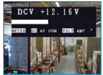
Full function digital multi-meter with large on-screen display tests AC/DC volts, AC/DC current, ohms and continuity. Auto and manual range selections