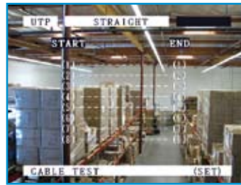
Wire map tester for UTP cabling with clear display of fault condition