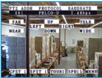
PTZ control with addressing for up to 255 cameras, 20+ protocols and 4 baud rates with selectable RS422/488 communications