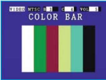
Test pattern generator outputs color bar and solid red, green, and blue screens in NTSC or PAL format