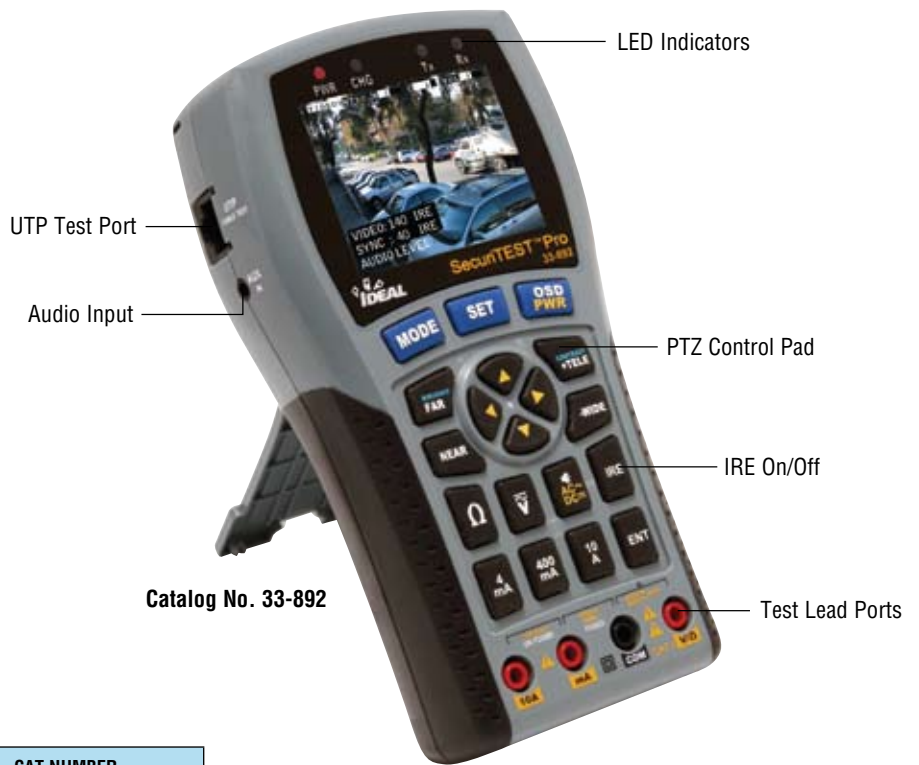
Catalog No. 33-892

SecuriTEST PRO adds to the already impressive capabilities of the SecuriTEST by including all the features of the original, plus IRE testing (video and sync levels), audio level testing, a high-capacity lithium ion battery in a package that's smaller and lighter than before. The SecuriTEST PRO has all the features and functionality that CCTV technicians need to install, test, and maintain analog security camera systems. SecuriTEST PRO also includes a custom carrying case (optional with the standard SecuriTEST).