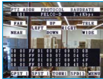
PTZ protocol analyzer can be used in-line to troubleshoot keyboard controllers and cameras