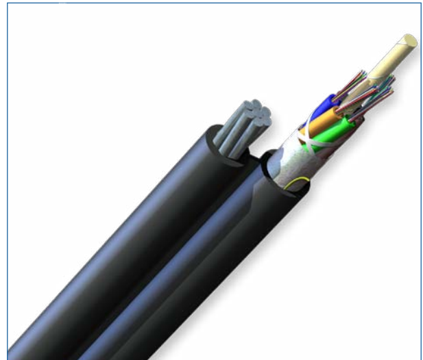
Part Number: 048EUA-T4101D20

Design and Test Criteria ANSI/ICEA S-87-640