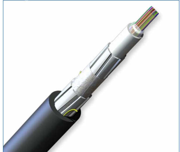
Part Number: 048ECF-14101-20

Easy field installation and reduced labor costs