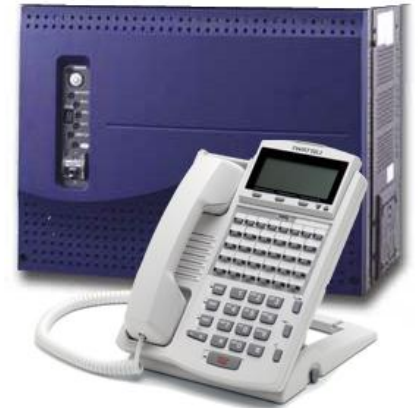
PBX-64 with PBX-PHONE