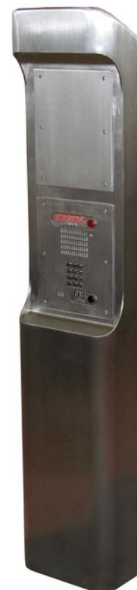
Shown with ETP-400K and blank faceplate