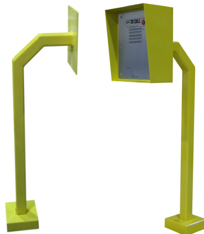
Shown with ETP-SMH

Mounting: Mounts into concrete foundation using anchor bolts