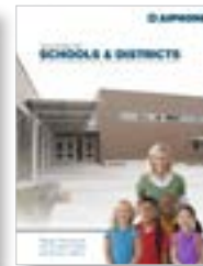
School Market End User Brochure #99579