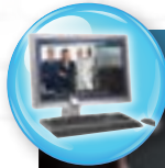
PC Master Stations

Protect staff by giving them the advantage to safely confirm the identity of visitors before unlocking the entrance with door release.