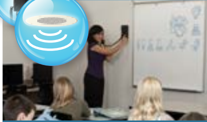
Rooms & Common Areas

Broadcast messages throughout the building or to a specified room or office with the choice of either a hands-free or handset reply.