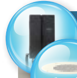
Subs & PA Systems

Communicate between offices from within a building or with an office across town. Internally communicate using a standard or PC master station.