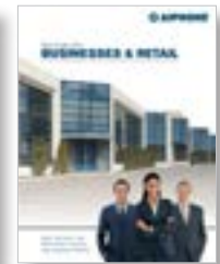
Commercial Market End User Brochure #99586