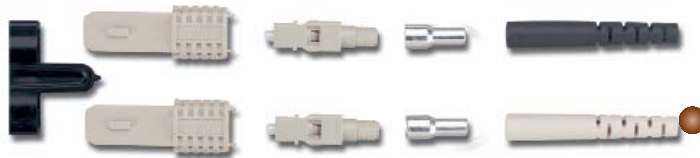
SC Duplex Connector for Jacketed Fiber

SC duplex configuration features a duplexing clip, which allows each connector to be removed individually. The duplexing clip also speeds troubleshooting — an individual connector can be removed and re-terminated without disturbing the adjacent connector