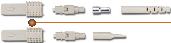
SC Simplex Connector for Jacketed and Buffered Fiber

Strain and bend relief boots provide improved plug-to-cable retention and maximum performance by preventing fiber deformation caused by mechanical strain