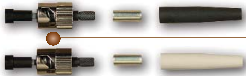
ST Connector for Jacketed Fiber

ST coupling nut is metallic to assure optimum durability and engagement. Ramps are radial to facilitate mating/de-mating