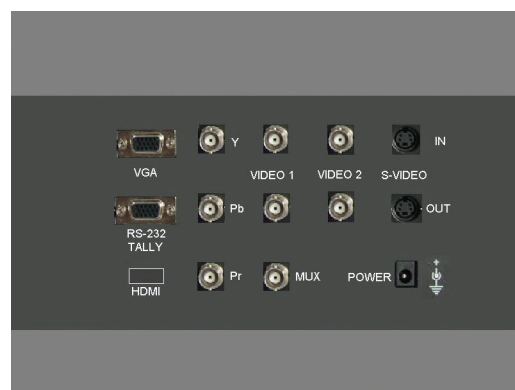
LCD-842HD (back view)