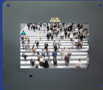
LCD-560LX Flush Mount (no front controls)