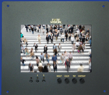
LCD-560L Flush Mount