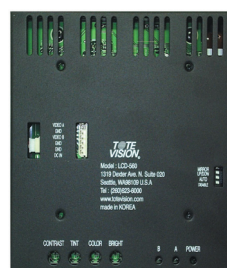
LCD-560 Back View