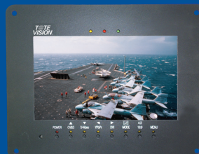
LCD-703HDL Flush Mount