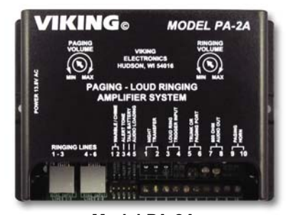
Model PA-2A See DOD# 485 for more info

The PA-2A will also generate an adjustable loud ringing from up to 6 C.O. lines or from a dry contact closure. Either a loud electronic warble, or one of three other soft chime sounds may be selected. An external "night transfer" switch can be added to turn loud ringing on or off in night bell applications. The PA-2A is easy to install and eliminates the installation of multiple bells, relays and paging cards. The unit comes complete with a power supply, amplifier and (1) paging horn.