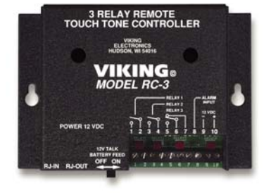
Model RC-3 See DOD# 165 for more info

For more information on using the RC-2A or RC-3 in conjunction with the K-202-DVA see application note (DOD# 878).