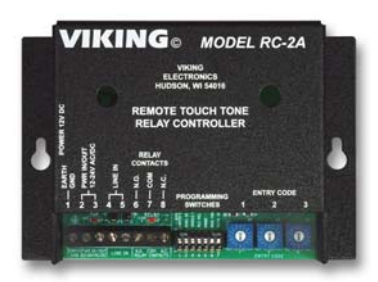
Model RC-2A See DOD# 160 for more info

The RC-2A Remote Controller provides remote relay operation from any standard Touch Tone telephone.