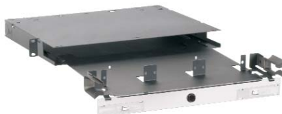
Opticom® Rack Mount Fiber Enclosures