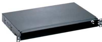
Opticom® Rack Mount Fiber Trays