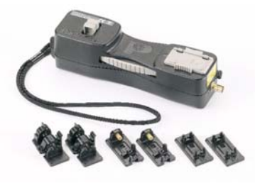
OCTT (Patch cords available separately or in termination kits)

***Substitute for fiber type: For multimode, insert XAQ for 10Gig<sup>™</sup> 50/125µm, 5BL for 50/125µm, or 6BL for 62.5/125µm. For composite ferrules, insert a P after the M in the part number. For singlemode, insert BU for 9/125µm, and replace M with S. Dimensions are in inches [Dimensions in brackets are in millimeters]