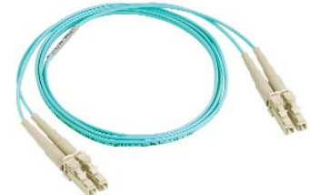
F ^ E10-10M ^ Y

^Substitute for fiber type: Z (OM4 – 10Gig™ 50/125µm), X (OM3 – 10Gig™ 50/125µm), 5 (OM2 – 50/125µm), 6 (OM1 – 62.5/125µm) and 9 (OS1 – 9/125µm). For plenum (OFNP) rated cable, place a P after the fiber type (^) and drop the Y.