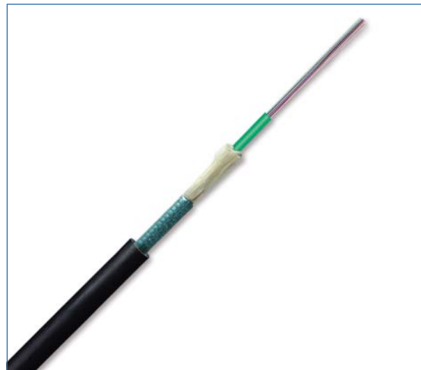
Part Number: FWCT01-S0024-G004

Easy identification of the individual fibres