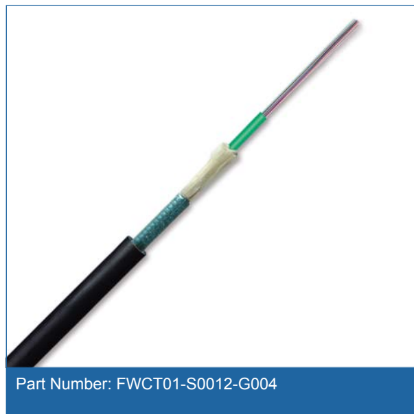
Part Number: FWCT01-S0012-G004

Easy identification of the individual fibres