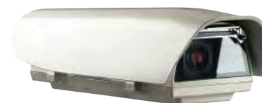
HOV + WIPER