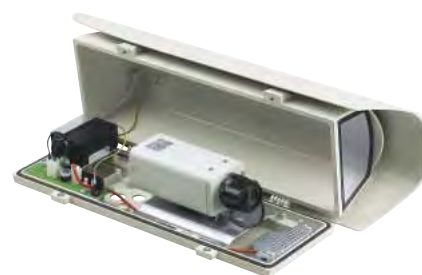
HOV + CAMERA