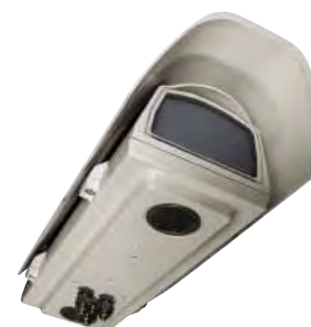
HOV + COOLING SYSTEM

→ VERSION FOR THERMAL IMAGING CAMERAS AVAILABLE: HTV □ 133