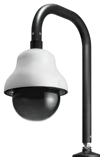
DBH24K0F022 + DBH05