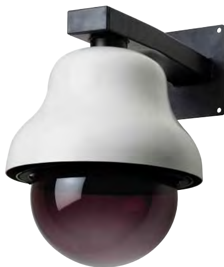
DBH24K + DBH04

The base model is supplied with internal adapters for various cameras, speed domes or network cameras and includes sunshield and fan-assisted heater.