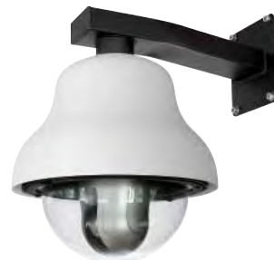
DBH24K (PANASONIC ADAPTOR) + DBH04