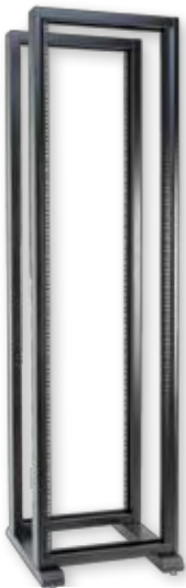
RS-42, RS-42, RS-P