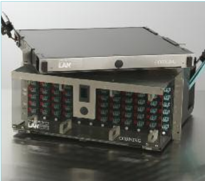
PCH-01U and PCH-04U Housings | Photo LAN585