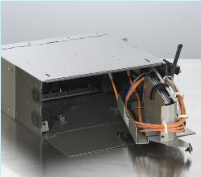
PCH-04U with Splice Option | Photo LAN738

The units include the patented universal cable clamp for cable strain-relief and optional splicing accessories are available. The housings have rugged metal construction and are shipped with everything needed for installation.