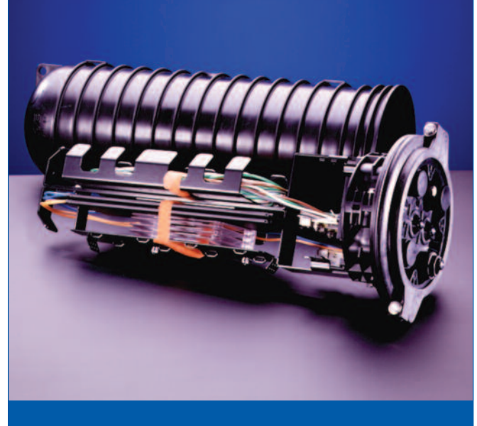
SCF-6C22-01-72 Fiber Splice Closure | Photo SHD38