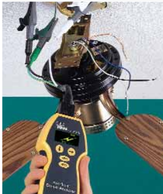
AFCI testing with alligator clips on an installed device.