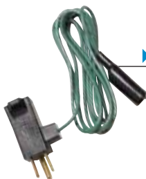
► 61-175 and 61-176

Ground Continuity and Isolated Ground Adapters, respectively