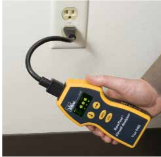
Troubleshoots branch circuit problems with a variety of tests at the receptacle.