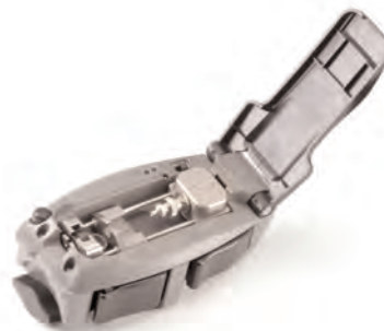
UniCam Pretium Installation Tool | Photo LAN770

* UniCam Connectors are guaranteed to meet the published specification at the time of installation.