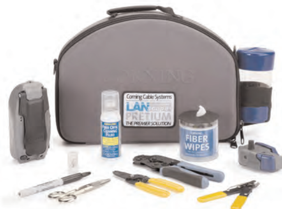
UniCam Pretium Tool Kit | Photo LAN769