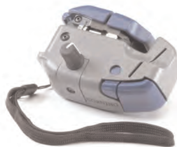
Pretium Cleaver | Photo LAN805