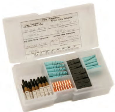
UniCam Connector Organizer Pack (Multimode SC Connectors shown) Photo LAN809