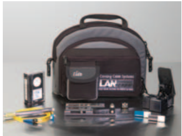
TKT-UNICAM-ELITE™ Installation Tool Kit | Photo LAN595