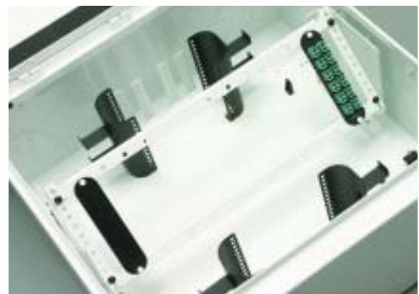
Fiber Zone Box Configured for 12 CCH Connector Panels or Modules | Photo LAN594