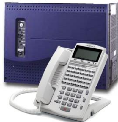
PBX-64 with PBX-PHONE